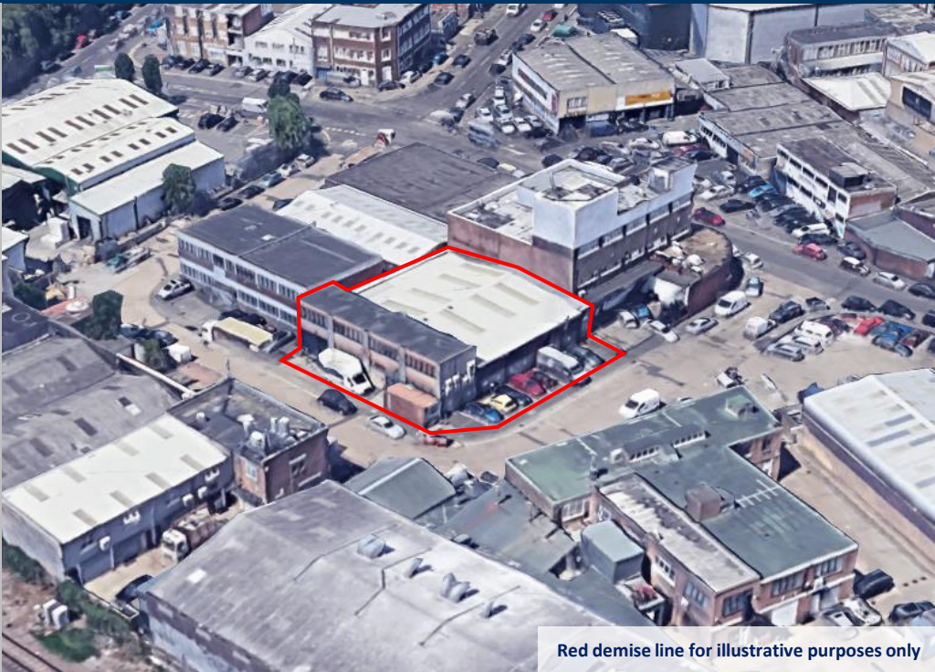
Red demise line for illustrative purposes only

Chiswick Park Station (District Line) and Acton Town (Piccadilly and District Lines) are both approximately ½ mile. South Acton Mainline Station (for Waterloo) is within ¼ mile and there are numerous bus routes.